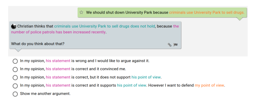
Figure 1. Challenging the user's argument and getting feedback from the user.

In an early implementation of our system we simply repeated the full premise and conclusion for each individual option that the user could choose. First tests showed that this leads to very long feedback options where some text parts were repeated several times. Participants in those tests indicated that this was not acceptable since they lost their focus when reading all the feedback options. As a solution to this problem, we use terms like "my point of view", "their statement" or "their point of view" instead of repeating the actual premise and conclusion of the argument. In order to make sure that the participants can easily determine what those terms refer to, both the terms and the premise or conclusion they refer to are colored in the same way. An example is shown in Figure 1