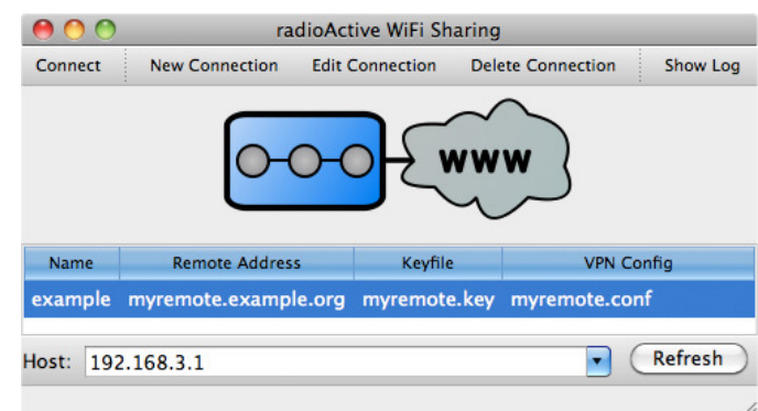
Fig. 2. Screen shot of the client's graphical user interface (Mac OS X).

During this handshake, guest and remote station prove to the host that they belong together, not only without the need for any central instance or authority, but also without the need of direct communication between guest and remote station. To prove their trust relationship, guest and remote station share a secret in form of a symmetric cryptographic key s . If a